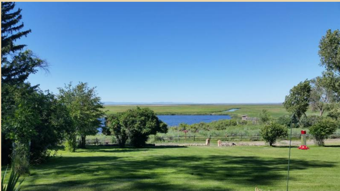
A clear summer view from the deck of the Malheur NWR Visitor Center.