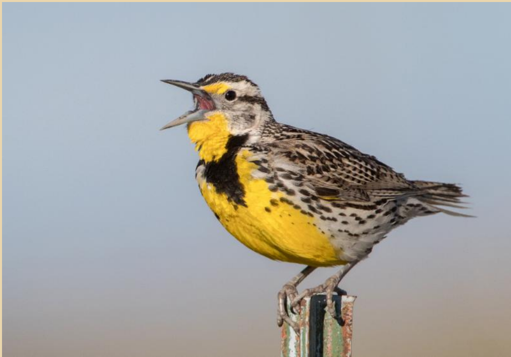
Western meadowlark singing its heart out