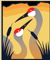
Friends of Malheur NWR logo pin

This new section will include special information for Friends of Malheur NWR Members. If you are not yet a FOMR Member, please consider 2019 the year to become a Friend as we celebrate our 20th Birthday all year!