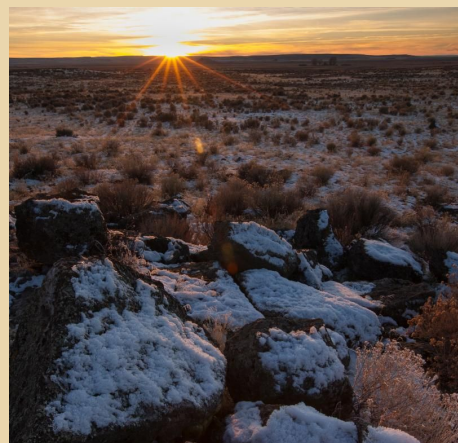
Sunset over snow- and lichen-encrusted rocks at Malheur Refuge

As most of Malheur Refuge's wildlife takes leave for the season, as many of the shrubs and grasses die back or slip into winter dormancy, the arid landscape is laid bare, somehow emptier and more desolate than before. But the grand architects of this high-desert ecosystem remain in place as they always have, humble and unassuming, right below your feet. They are known as cryptobiotic soils, or microbiotic soil crusts.... Read more here .