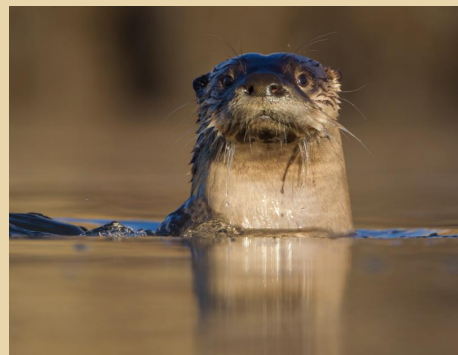
River otter in the Blitzen River

Learn more about how common carp affect aquatic health in the Harney Basin.