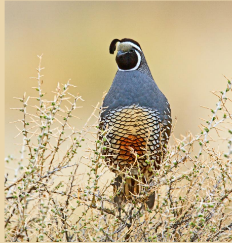
Male California quail