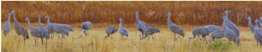
Sandhill Cranes stop at Malheur Refuge to refuel as they migrate south to wintering grounds.

quiet time at the refuge; a good time for solitude and communing with nature.