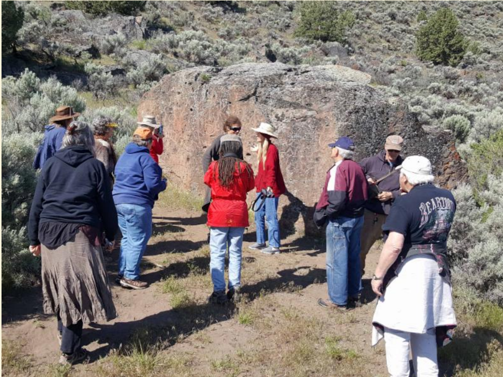
Friends members investigate the Krumbo rock art boulder. These petroglyphs are estimated to be 3,500 years old.