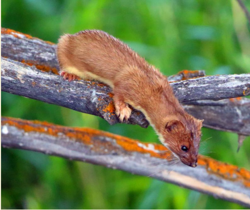
A long-tailed Weasel at Benson Pond, taken May 28, 2016 .

A major highlight of our tour was a visit to Boca Lake which is normally closed to public access to protect breeding birds from disturbance. This is the largest managed wetland in the Blitzen Valley and is a very important brood site for refuge waterfowl. Many of the ducks will move to Boca Lake to raise their ducklings, where the large open water areas allow better escape from predators such as coyotes and mink. Also, Boca Lake regularly supports large colonies of Eared Grebes (up to 2500 nests have been counted there) and a few Western and Clark's Grebe nests.